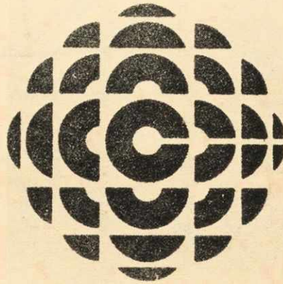
Liberal tactics "smack more of Inquisition"

Syndicated columnist Charles Lynch wrote the following day that "Trudeau has instructed the publicly owned CBC to bend over, and he has invited another federal agency, the CRTC, to apply the paddle where it will do the most good for Canada".