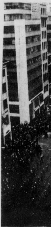
The 1979 St. parade at Rockefeller