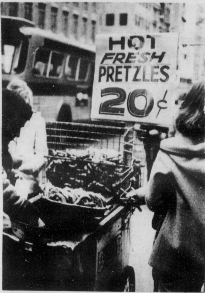
New Yorkers eat on the run, and pretzles are a common street item.