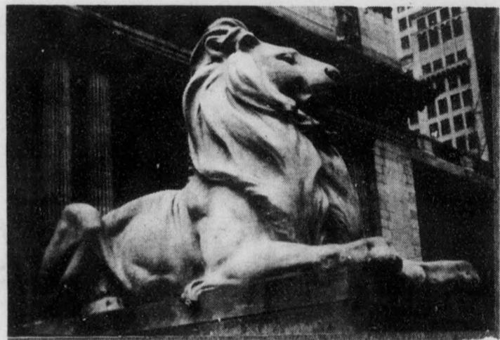
One of the famous stone lions guarding the New York Public Library.