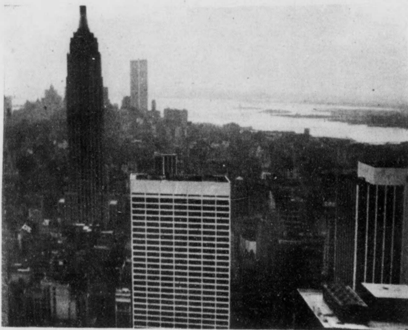
Looking toward mid and lower Manhattan from Rockefeller Center. Note the Empire State Building and in the distance, the twin towers of the World Trade Center.