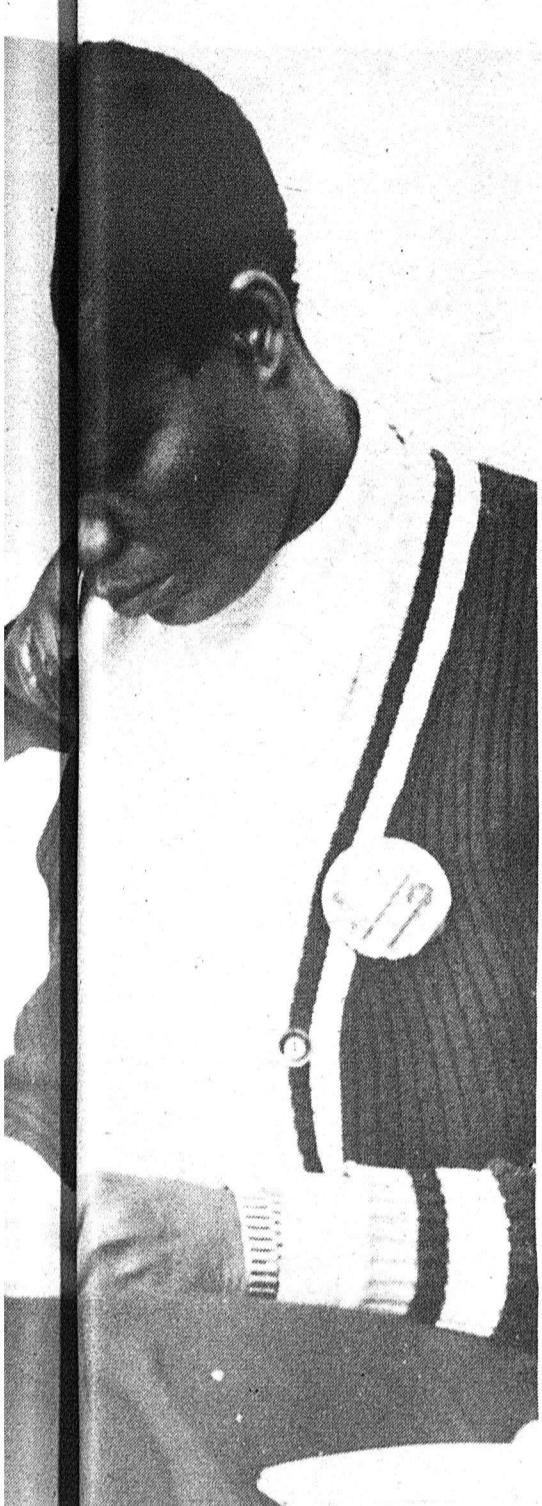
...ale's short discussion with the SU executive. The ...s under regime to a packed Tory audience.