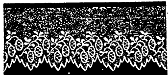
B 302 —Cambric Embroidery, 3½ inch; work, 1½ inch..... .08