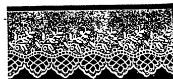
B 304 —Cambric Embroidery, 4 inch; work, 2 inch..... .12½