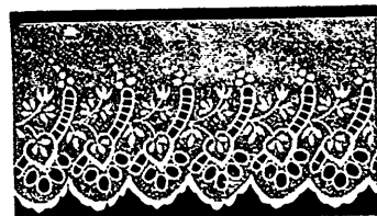
B 303 —Cambric Embroidery, 6 inch; work, 3 inch..... .10