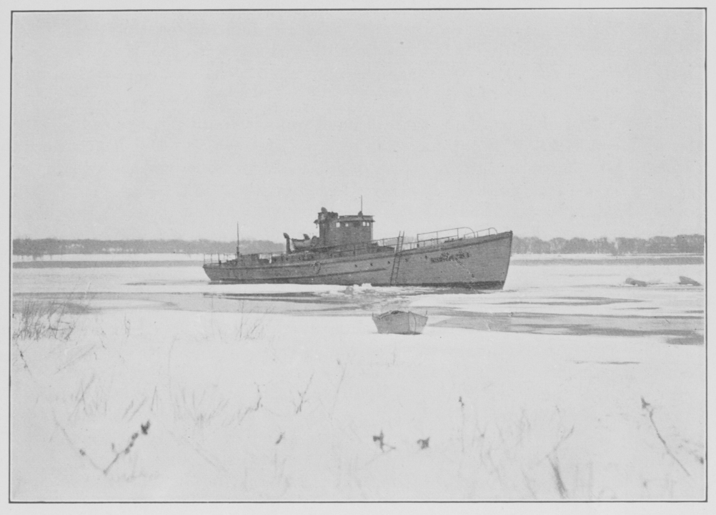
"STUMBLE INN" when taken over by the Department of National Revenue, 1929