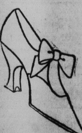
New Theo Ties