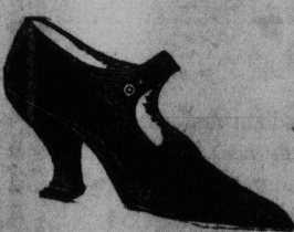
New One Straps

Many other Paris, New York and Montreal Designs in all the popular leathers.