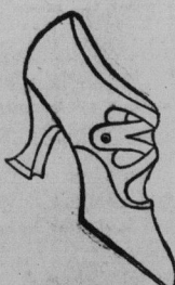
New Cross Straps

Select your New Easter Footwear today from Us.