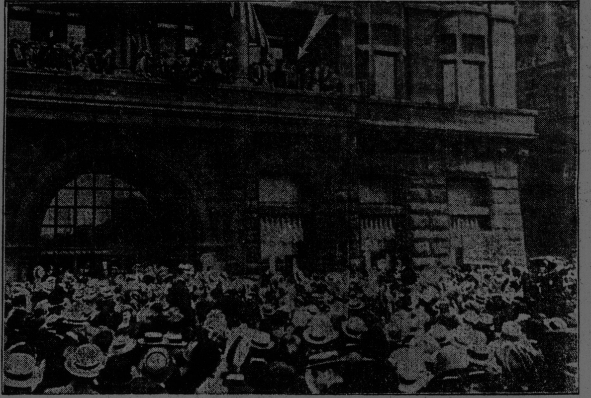
This picture shows the culmination of Colonel Roosevelt's "hike" to Chicago when, after a breathless trip across country, and a parade through Windy City streets, he stepped out onto the balcony of the Congress Hotel and addressed a crowd of 5,000. In his speech the president—perhaps said the campaign had been one of thievery and he wanted to understand the one who receives stolen goods is just as guilty as who steals. The at row indicates the colonel.