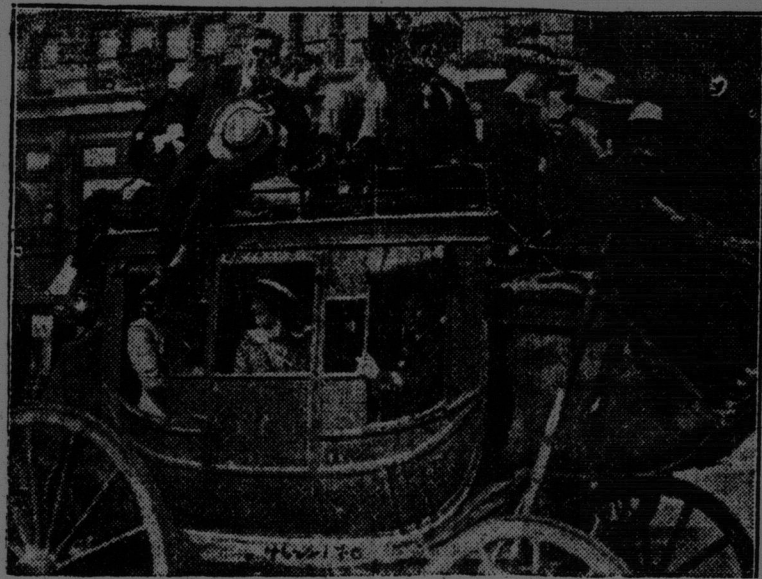
Novelty was introduced into the proceedings at Chicago, but the appearance of a real old-fashioned stage coach—the kind that grandfather rode in before there were such things as trains. In it rode the wives of the California delegates to the convention.