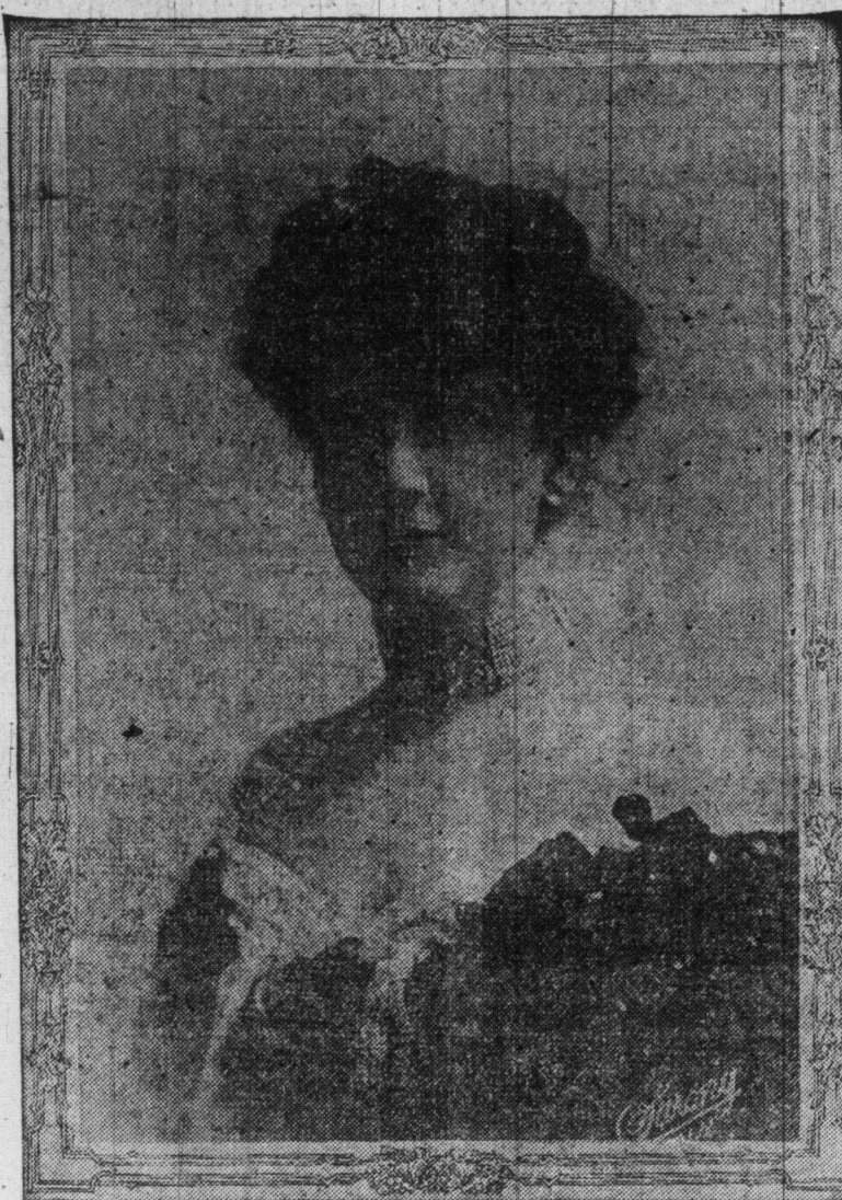
MAY ROBSON, IN "THE REJUVENATION OF AUNT MARY," AT THE PRINCESS THEATRE NEXT WEEK.

There have been two thousand and twelve performances of Eugene Walter's marvellously popular "Paid in Full," and the play has been acted for a total of two hundred and forty-four weeks; yet it is actually only in its second year so far as the big theatrical world outside of New York is concerned. If this combination of figures sets you guessing, find the answer in the fact that five companies have been playing "Paid in Full" at the same time. For the first year after the piece was produced in New York and made the sensational hit of the period, only a Broadway company was maintained. Summer before last a second company was organized for Chicago. Then, last autumn, seeing the demand for the play, the Wagenhals & Kemper Company formed three more companies, which made five in all. It was the first time so many companies had been in one play. Up and down and across the United States went "Paid in Full." Each visit to a city created a demand for its return. So back it went, five and six times in some instances, thereby proving its amazing hold on the public, for every time it returned, a bigger matter how frequently, it drew a bigger audience than before, until at the end of last season 2,500,000 persons had attended the 2012 performances.