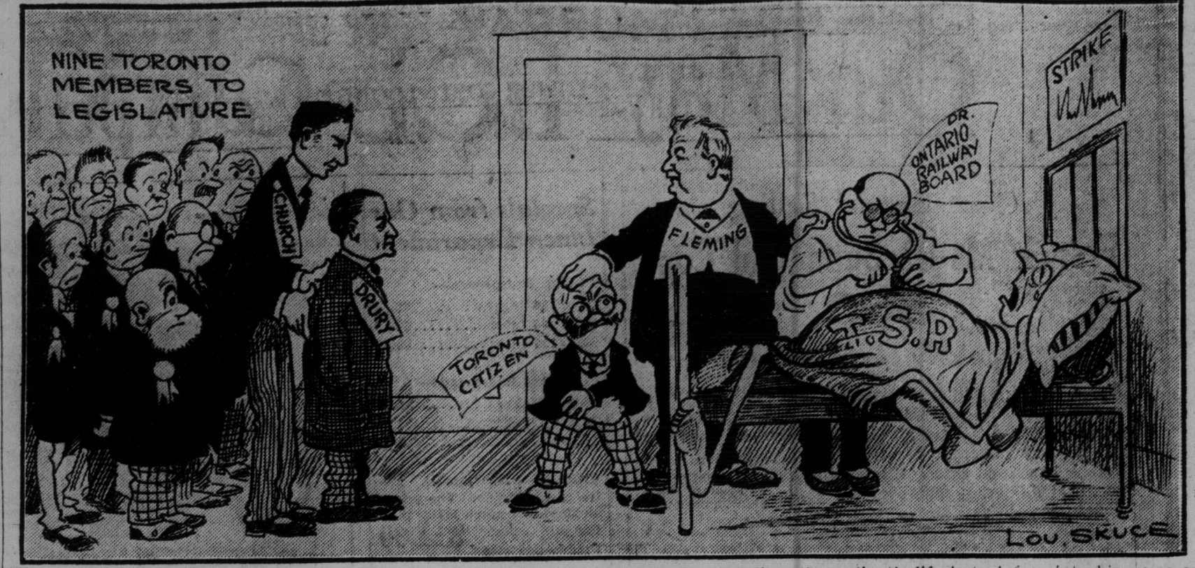
constitutional rights of the city of Toronto is brought down, rushed thru Toronto Citizen-"Not while I still have my health."