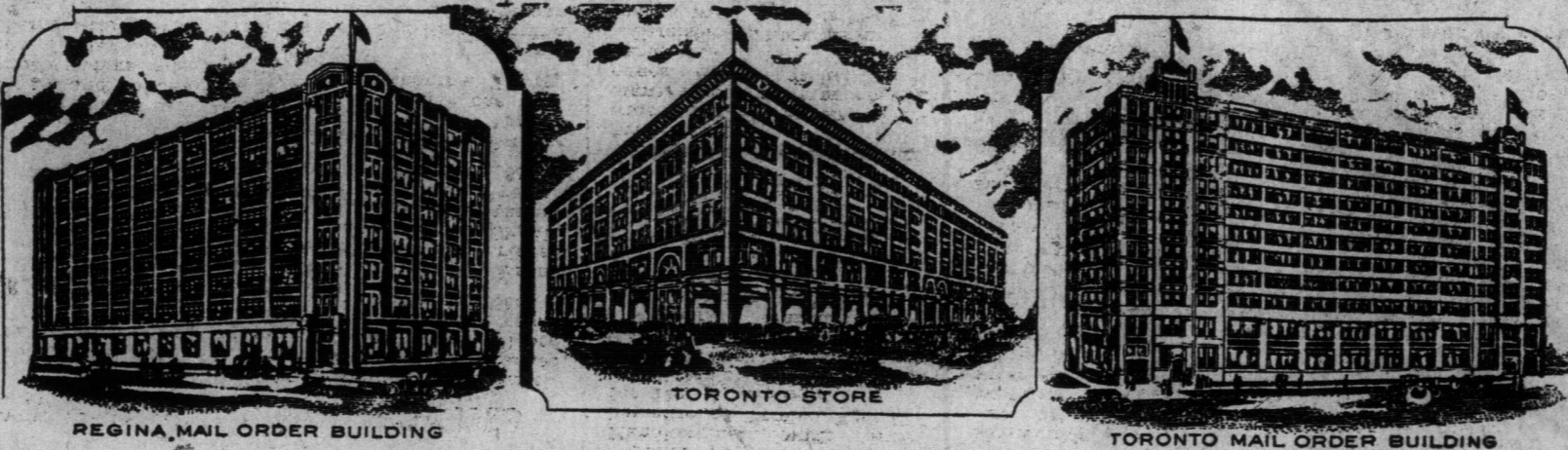
REGINA MAIL ORDER BUILDING

A host of plain colors, plaids and Roman stripes. Some 60-inch scarfs in the lot. On sale at three prices, in each of above three departments. Today, 95c, $1.95 and $2.95. Simpson's--Main, Second and Third Floors.