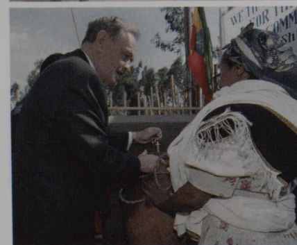
<< Prime Minister Chrétien fills a water jug at the Water and Sanitation Services for the Poor and Destitute Project in Addis Ababa, Ethiopia.