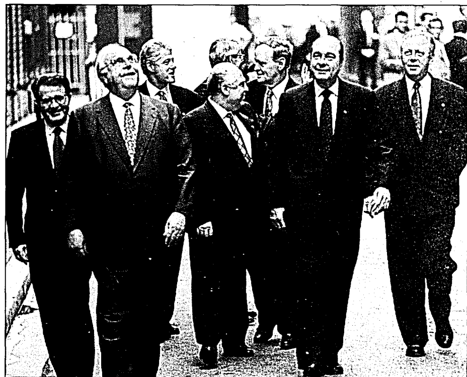
Canada was an active participant at the 1996 G-7 Summit, held in Lyon, France.