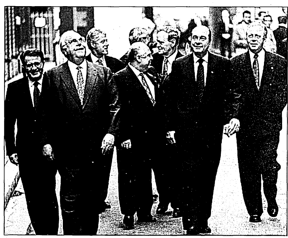
Canada was an active participant at the 1996 G-7 Summit, held in Lyon, France.