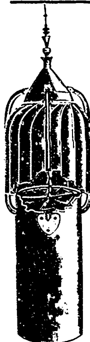
The above cut shows a part of the interior of the Ventilator.

Estimates for copper ventilators given on application.