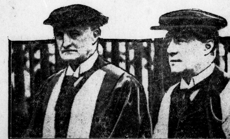
Premier Baldwin and Lord Grey, after receiving honorary degrees from Cambridge University.