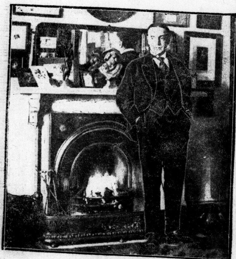
Sir John Martin Harvey, noted English actor, has purchased a home for himself in East Sheen where he will live after his active career has ended.