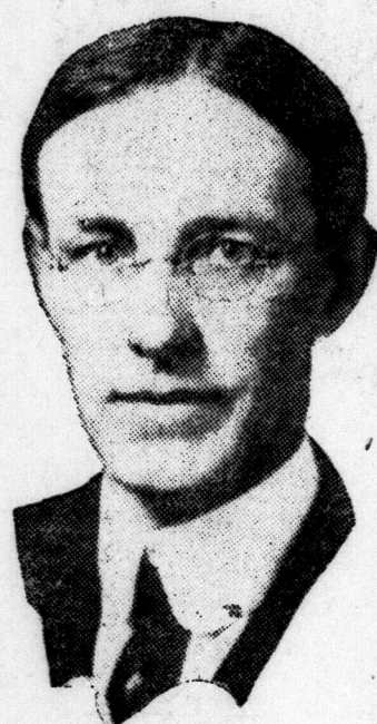
Dr. Alexander Meiklejohn, former president of Amherst College, superseded following a dispute over educational methods.