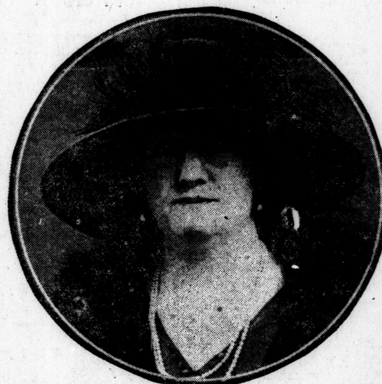
The Marchioness of Townshend photographed when selling roses outside the Ritz Hotel in London on Alexandra Rose Day.