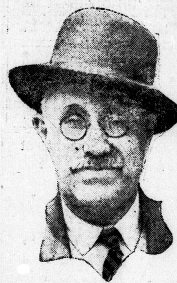
"Pussyfoot" Johnson, who is drying up the world, off for a six months visit in London.