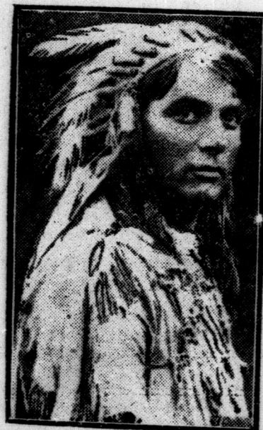
Pau-puk-kee-wis, Indian dandy and gambler of the old days, as he will be played by a member of the Ojibway Reserve in a pageant at Sault Ste. Marie.