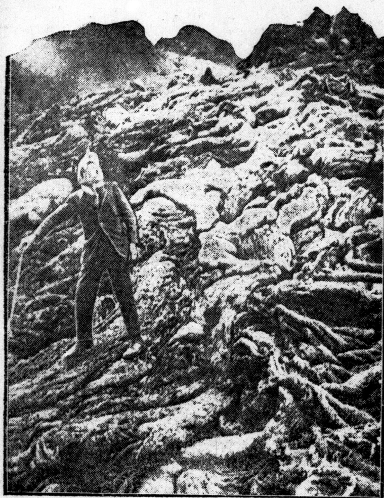
Coils of lava ejected from the inner crater of Vesuvius. The lava is like thick twisted hemp rope.