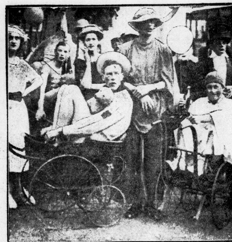
A unique pram race with unique infants staged by undergraduates of Cambridge during one of their recent celebrations.