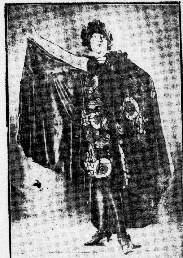
The dog days are upon us, also the bathing suits. Here is an elaborate costume of black satin, stencilled in gold with wide cape.