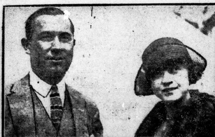
Walter Hagen, dethroned British open golf champion, returns to America with his wife.