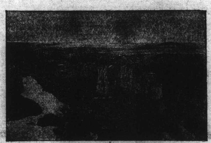
Beaver Dam Creek and Sandstone Rock