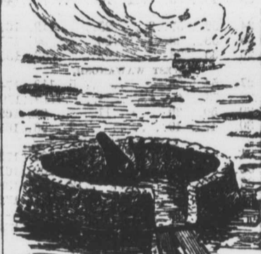
THE "SWAMP ANGEL."