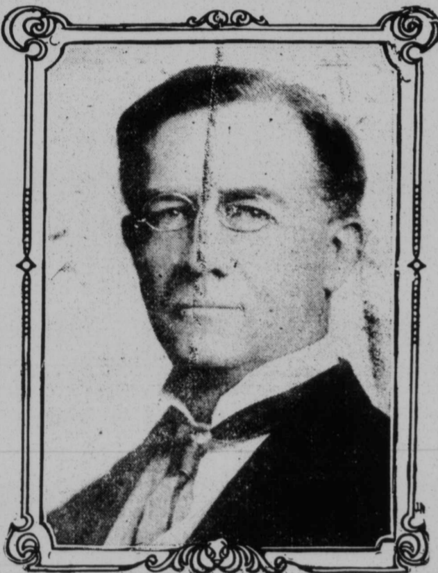
GILBERT M. HITCHCOCK.

Senator Hitchcock, of Nebraska, is expected to be one of the leaders in the fight to oppose war with Germany when Congress meets. It is said he wants the United States to stand on armed neutrality and take no further steps toward war.