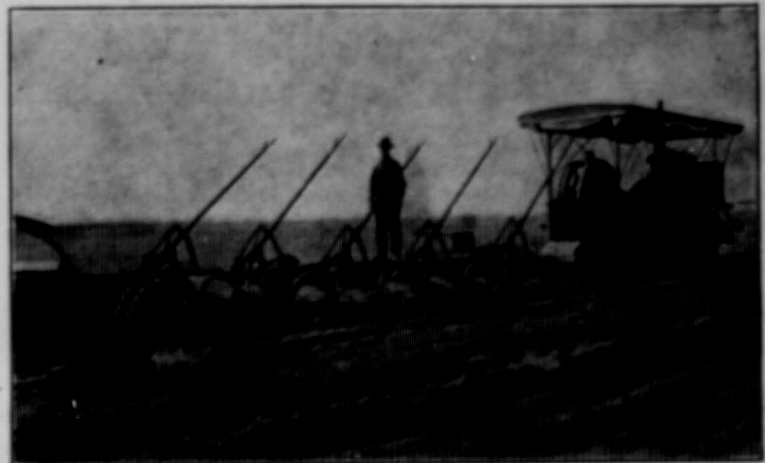
CATERPILLAR Pulling Ten 14-in. Pines and Packer at Namaka, Alta.