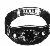
No. 7—Price, $3.50. 1 Garnet, 2 Pearls. 5 New Subscribers.