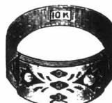
No. 5—Price, $3.50. 2 Pearls, 3 Garnets. 5 New Subscribers.