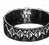
No. 8—Price, $2.00. 3 New Subscribers.