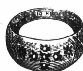
No. 6—Price, $3.50. 2 Garnets, 5 Pearls. 5 New Subscribers.