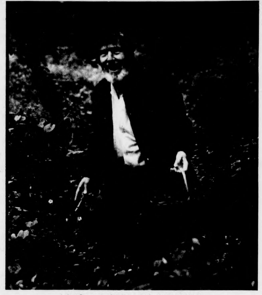
John Cage, gathering mushrooms at home.

"Our whole notion of the funamental nature of rhythm in music is simply a jump from the flow of the blood to the beat of the heart; and more essential than the beat is the flow."