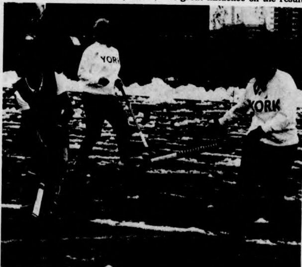
York girls try to stop a Western offence.

The Yeomen meet seven clubs (including Waterloo and Toronto) in the Ontario-Quebec league before the O.I.A.A. schedule begins Nov. 27 against Brock. They play Queens on Friday night in Kingston. The first home game is Sat., Nov. 1, at 12 noon against Carleton.