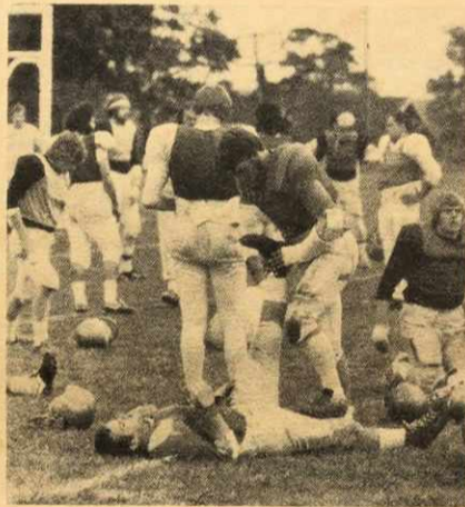
Exhaustion sets in