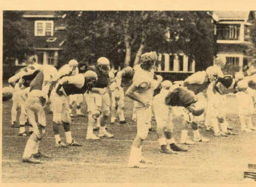
Working off the summer excesses

HOURS 9 a.m. to 5:30 p.m. WED, THURS, FRI 9a.m. to 9:30 p.m