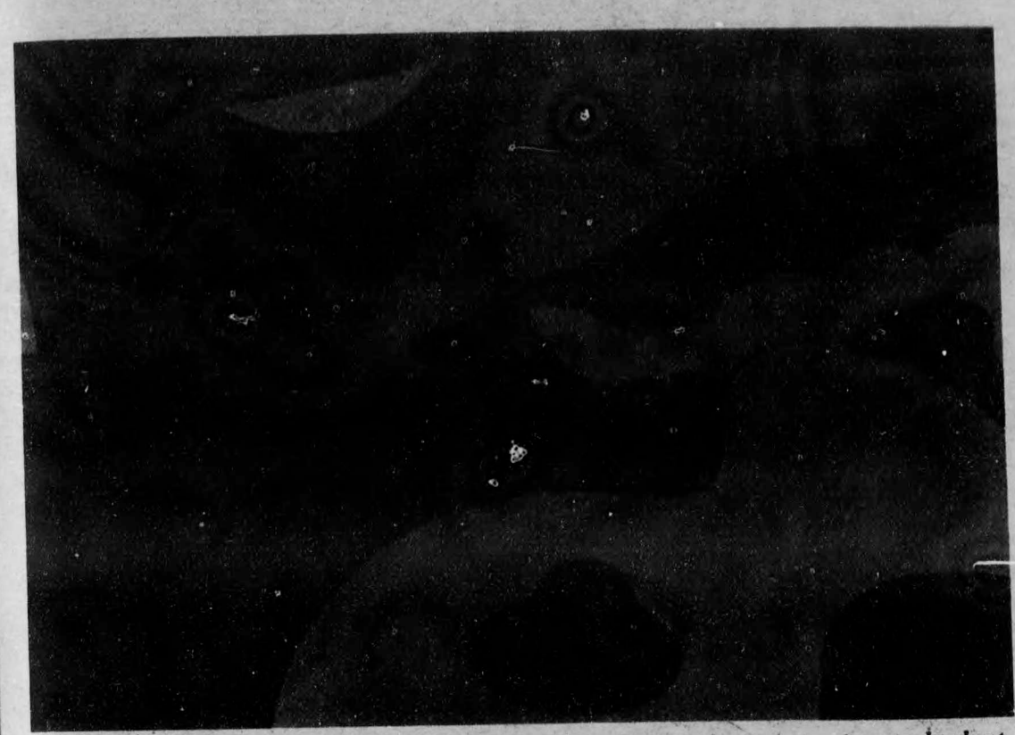
"Women in America are like packaged chicken in a supermarket: nicer to look at brunswicken

A sample of works by the world's most famous pop artists is currently on display at the creative art center. ions a whole exhibition of his work results in tremendous emotion. The nudes in the exhibition seem to be a parody