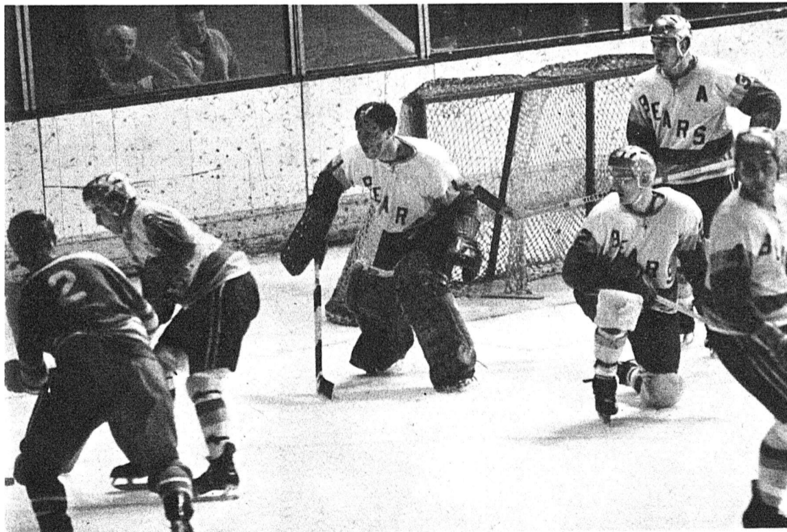
DEFENCE NO PROBLEM —By the looks on their faces the Bears look as though somebody might score. But thanks to scenes like this the opposition didn't score too often and the Bears won the gold medal at the Quebec Winter Games.