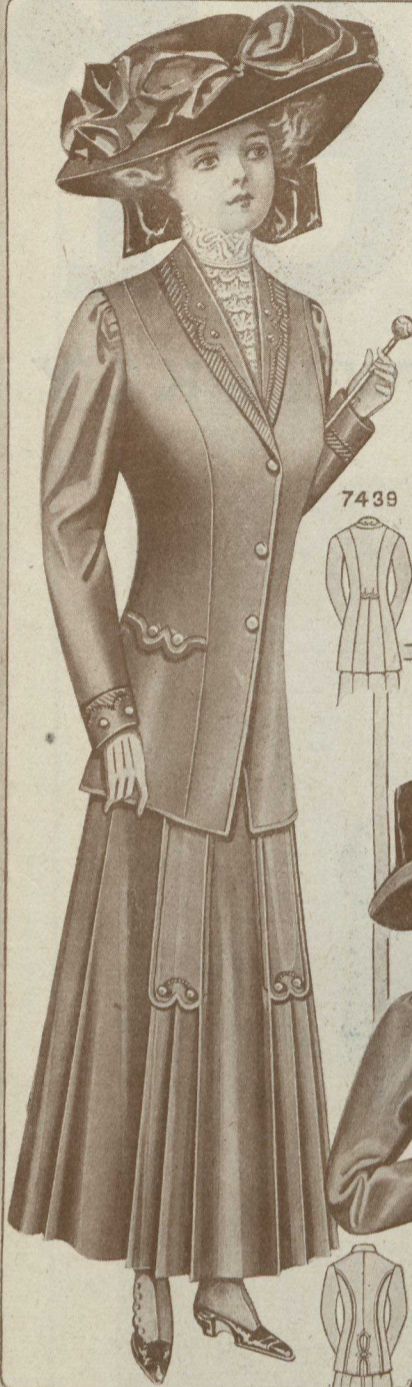
Misses' All-Wool Panama Suit