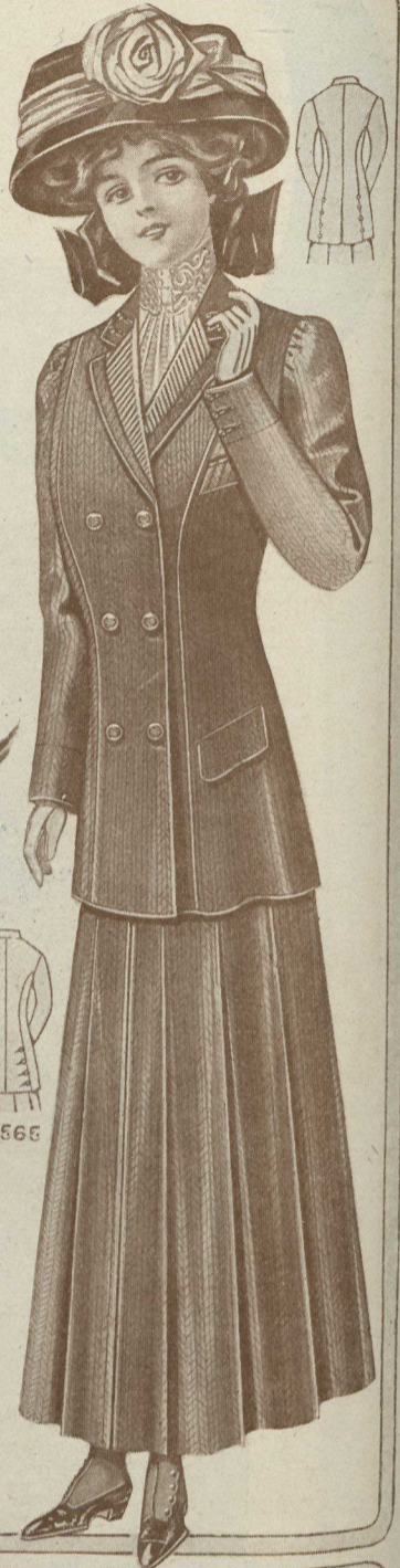
Misses' Fancy Worsted Suit