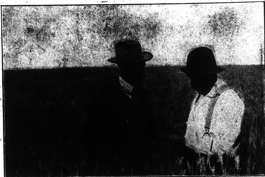
I should have a yield of 30 bushels to the acre, 5 miles from Mirror, Alberta, on the G.T.P. Railway

In order to lay the foundation of a laying flock I think it important to start with only one pair of fowls. These birds should be the best possible to ob- tain. They should be of good size and shape for the breed and always in good condition prior to the breeding season; that is, they should never have been sick. It is all well enough to have good looking fowls as well as fowls that lay and pay well but from a utilitarian