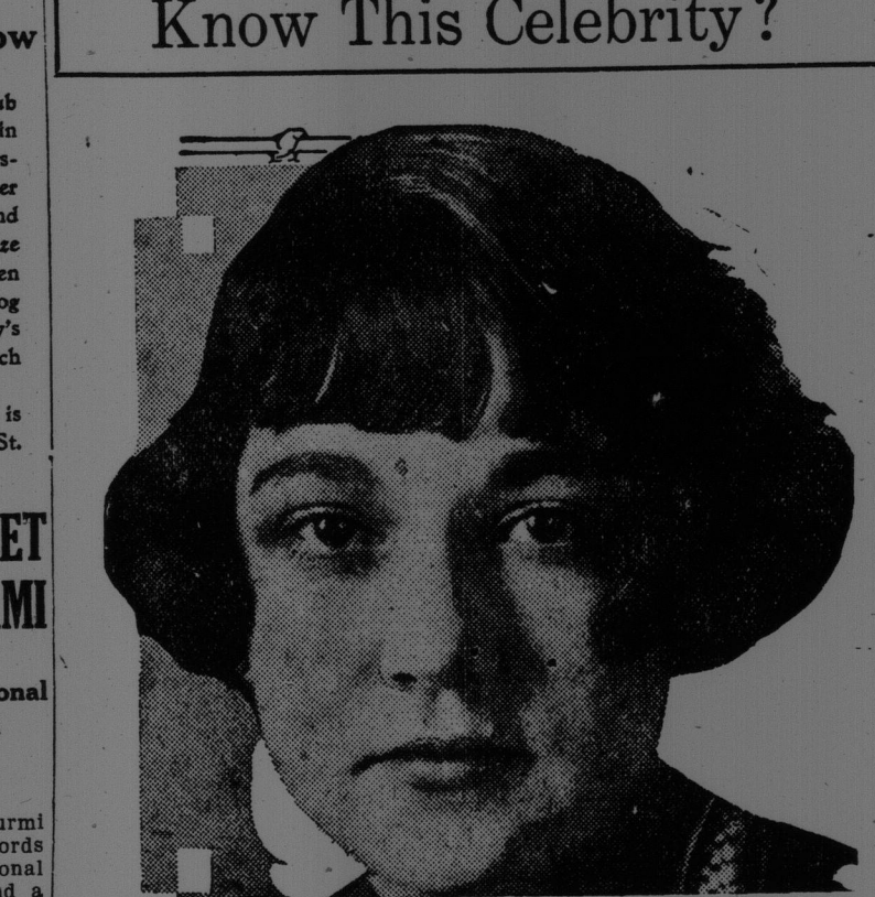
HELEN WAINWRIGHT Above is a likeness of Helen Wainwright, national all-round swimming champion, as she looks at her home in Flushing, Long Island, during the off season. Miss Wainwright is at present making plans to attempt to swim the English Channel next summer.