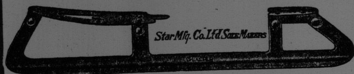
"Glacier"—A Favorite Starr Skate With Ladies.

Flexible Flyers . . . . . $3.00, $3.60 and $4.50 each Frames . . . . . 65c. to $1.95 each Boys' Clipper Sleds . . . . . 55c. to $2.20 each Dirigo Sleds . . . . . $2.10 to $2.40 each Baby Sleds . . . . . $1.80 to $2.50 each