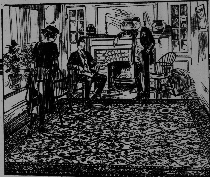
In the 9 x 9 foot size, the rug shown costs only $12.50

"I love this rug, Dad. It's so pretty and so easy to clean—and you'll never guess how little it cost!"