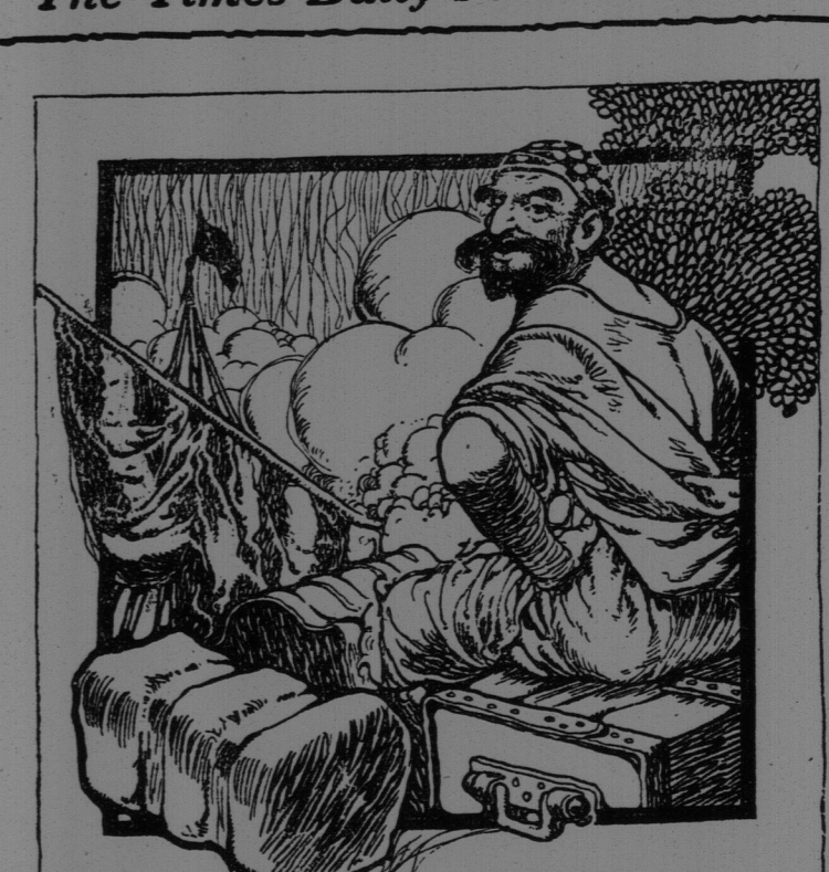
On his second voyage Crusoe was taken prisoner and made a slave by pirates. (Robinson Crusoe, by Defoe). Find Robinson Crusoe.

ANSWER TO YESTERDAY'S PUZZLE. Right side in miller's jacket.