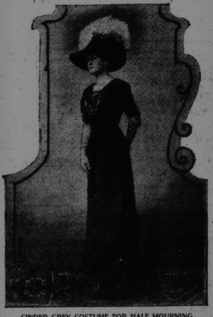
CINDER GREY COSTUME FOR HALF MOURNING