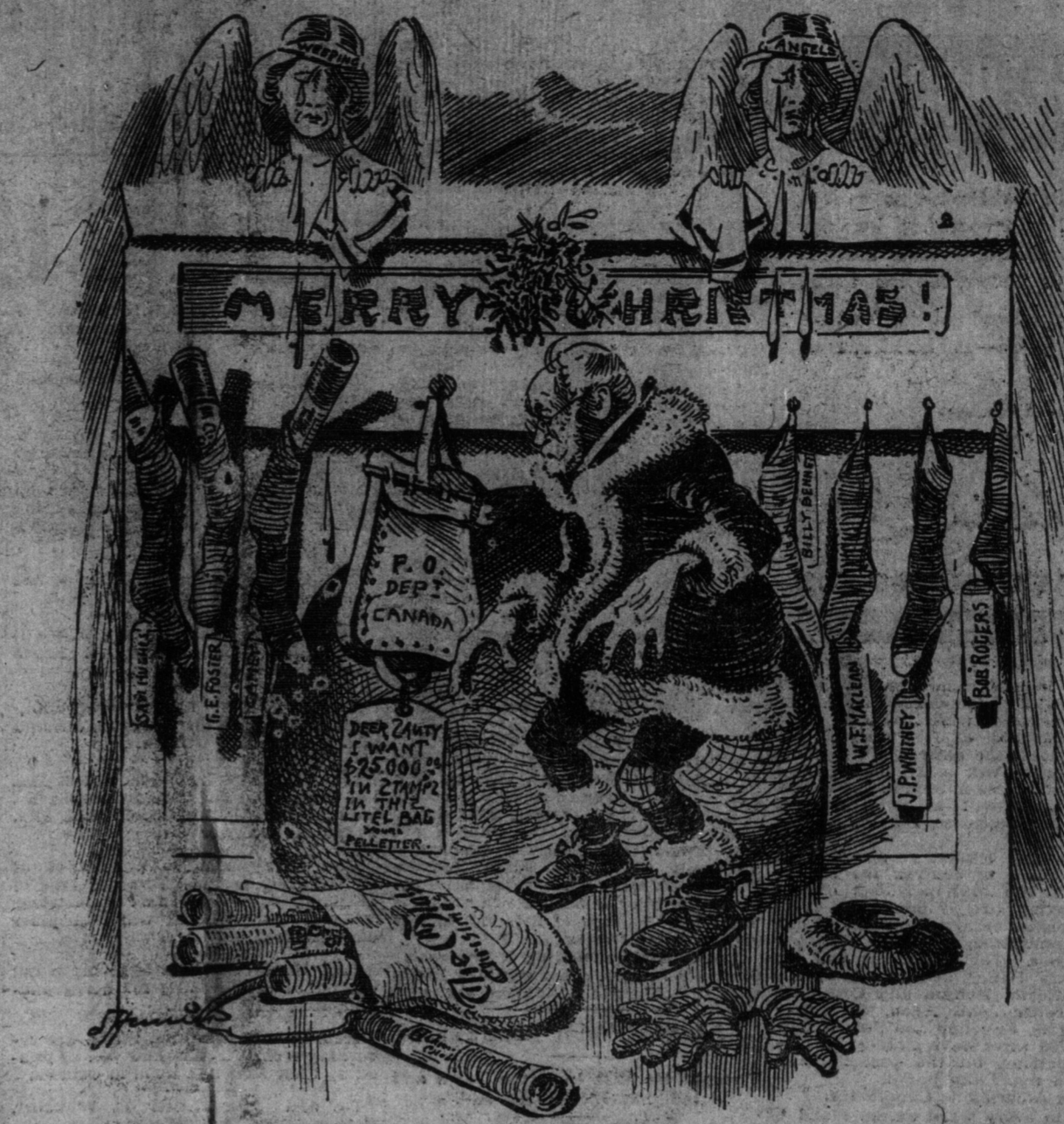
N.B.—This drawing was not entered for the Christmas Globe competition.