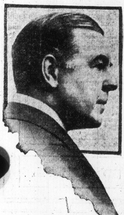
HENRY MILLER. Who will be seen in "Daddy Long Legs" at the Grand next week.

Rates Required. The rate of postage required on parcels addressed to the troops depends upon the location of the addressee. If the addressee is in England, the rate is 12 cents per pound; whilst, if he is in France, the parcels are subject to the rates applicable to parcels for troops, which are as follows: 1 lb., 24c; 2 lbs., 40c; 3 lbs., 48c; 4 lbs., 56c; 5 lbs., 72c; 6 lbs., 80c; 7 lbs., 88c; 8 lbs., 96c; 9 lbs., 1.10; 10 lbs., 1.18; 11 lbs., 1.26. These are exactly the same charges which existed for years between Canada, England and France before the war, and are the result of an agreement or convention made between these countries and Canada, and as these countries have not agreed to lower their rates between England and France, Canada has to pay to them the same rates as before the war and must charge the same postage. In all cases parcels for the troops must be addressed care of Army Postoffice, London, England, but this does not in any way affect the rate of postage, which depends entirely upon the location of the addressee.