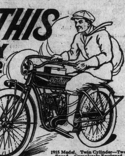
1915 Model, Twin Cylinder—Two Speed. Completely Equipped. Ready for the Road.