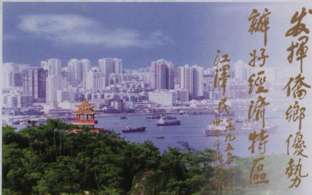
A View of the Booming City

Shantou, a harbour city and a famous hometown of overseas Chinese on China's southeastern coast, is one of the first Special Economic Zones (SEZ) in China. It governs five administrative districts—Longhu, Jinyuan, Shengping, Dahao and Hepu—and Nan'ao Island and, on behalf of Guangdong Province, also administers Chaoyang City and Chenghai City.