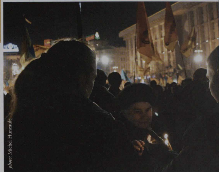
Democracy in action: A delegation of Canadians observed the repeat presidential election in Ukraine over Christmas 2004.

For long-term observers, such assignments begin well in advance of the election, with observing the registration of voters and candidates. Short-term observers sent prior to the vote focus on election day, watching for transparency and