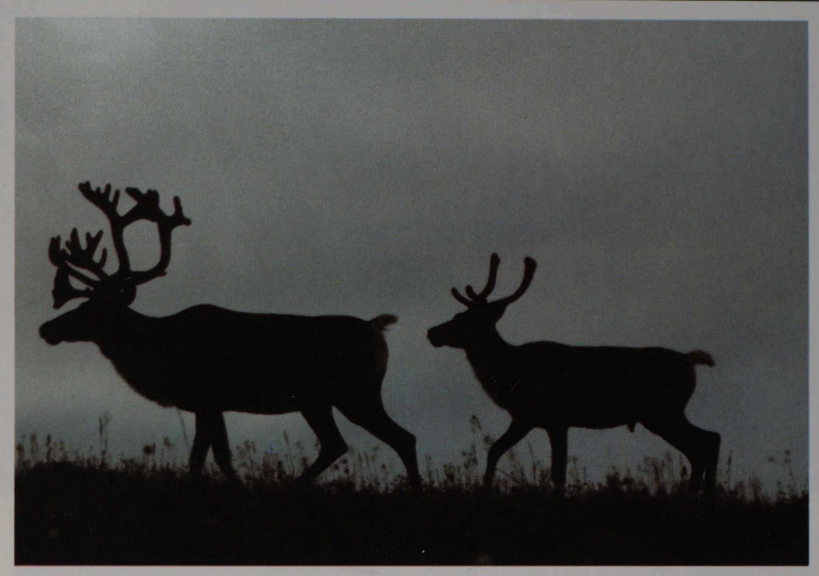
The caribou is the great survivor migrating to the coldest part of North America and taking sustenance from the barren ground. During this century its numbers have declined, and the US and Canadian governments are now engaged in concerted programs to protect its birthing grounds and migration routes from damaging developments.