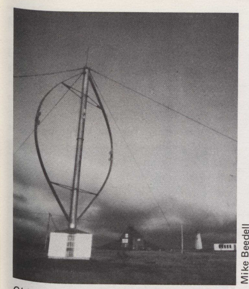
Old egg-beater style of windmill revived by NRC engineers. Tests revealed this was an efficient way of harnessing energy.

ferent types of windows, insulation and air conditioning, ventilation and lighting systems are all being tested.