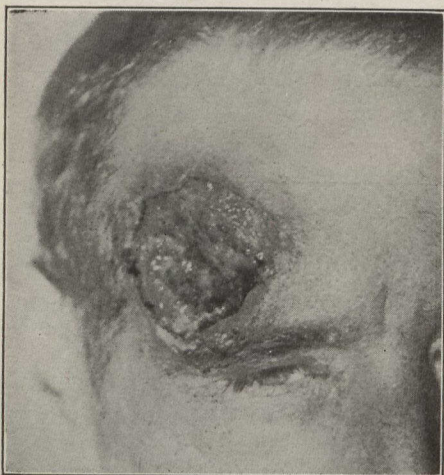
Plate III. Rodent ulcer of forehead, present for 5 years.