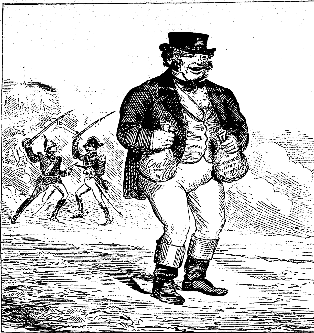
"L'HOMME QUI RIT!"