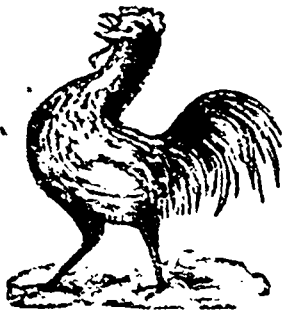
"I crow over all."

Shirts . . . Overalls . . . Jackets, etc.