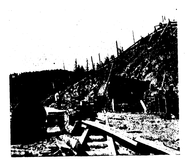
Starting the Shaft.

In a way, the Mother Lode is representative of most of the large gold-copper ledges of Boundary Creek. The croppings are in places soft oxides of iron from decomposition of ore bearing rock, and in others unaltered magnetic iron oxides very solid and compact, carrying copper pyrites and gold, such as the "blow-out" mentioned above, and in other instances the