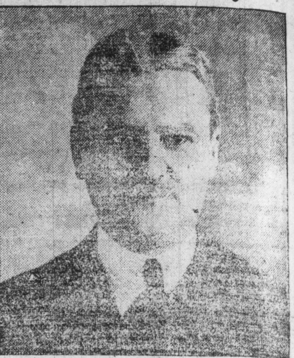
Lieutenant Colonel Walter Maughan.

The demobilization of the Canadian Expeditionary Force is perhaps the most important problem now confronting the Dominion Government, and the transportation of the troops from the port of landing to their home destination is a work which will require skilful handling.