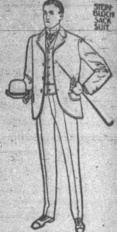
Copyright 1895 by The Stein-Bloch Co.

The Reliable Seattle Clothiers Opp. C. D. Co's. Dock