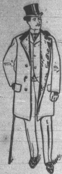
Copyright 1900. THE STEIN-BLOCH CO.

The only wholesale tailors in the world. All their goods are made by skilled artisans—Journeyman Tailors. Even the buttonholes are made by hand.