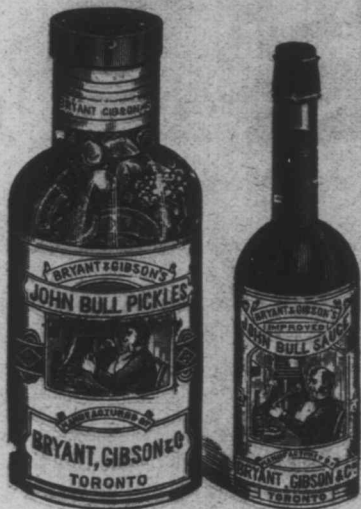
This is a facsimile of our bottles.

"Worcestershire Sauce," "Yorkshire Sauce," "Devonshire Relish" Raspberry Vinegar, Evaporated Vegetables, Chocolates, Coconuts, Confectionery.