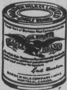
The Original and Leading Brand Since 1857

The quality basis established then has never been deviated from. And today the care and attention given to every part of their manufacture guarantees the goodness of every Milk Product bearing the name of