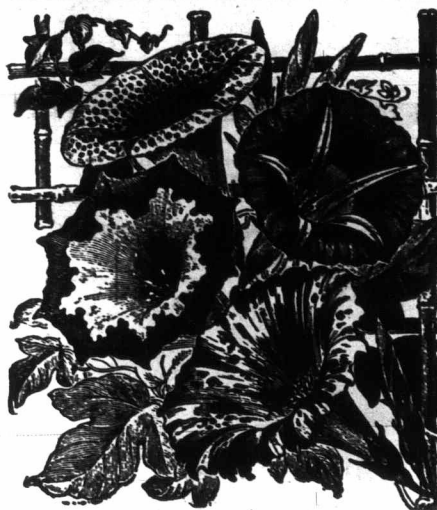
JAPANESE MORNING GLORY.