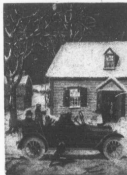
McLaughlin 5-Passenger Touring Car E-6-38

THE nation-wide reputation for the matchless efficiency of McLaughlin motor cars is the result of honest and persistent efforts in perfecting right principles of mechanical construction.