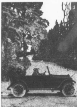
McLaughlin "Light Six" E-6-63