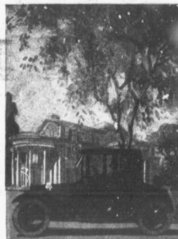
McLaughlin Touring Coupe E-6-46