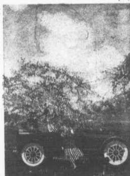
McLaughlin 7-Passenger Touring Car E-6-48