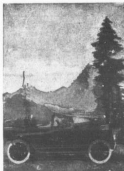
McLaughlin E-6-45 Special